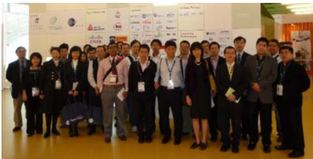
“HAFFA delegation - Visit to the Hong Kong RFID Centre”

Members also visited the Hong Kong RFID Centre which is an extension of Supply Chain Innovation Centre (SCIC) being funded and supported by the Innovation and Technology Commission of the HKSAR Government and jointly establishing by GS1 Hong Kong and Hong Kong Science and Technology Parks Corporation in October 2008. The Centre is divided into three thematic zones - Manufacturing Zone, Logistics Zone and Consumer Zone. Members had acquired how emerging EPC/RFID technology can be beneficial to all supply chain stakeholders in logistics and warehouse management via a series of showcases that demonstrate real-time and automatic data and event capture for accurate inventory management.