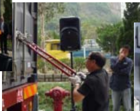
"Break the e-seal"