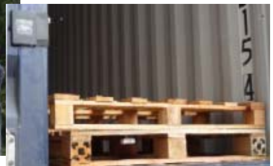
"Pallet attached with active tag"