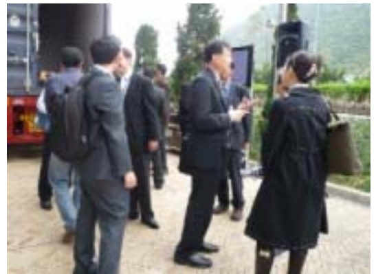
“Interactive discussions for the live test among expert speakers and delegates”

Members also visited the Hong Kong RFID Centre which is an extension of Supply Chain Innovation Centre (SCIC) being funded and supported by the Innovation and Technology Commission of the HKSAR Government and jointly establishing by GS1 Hong Kong and Hong Kong Science and Technology Parks Corporation in October 2008. The Centre is divided into three thematic zones - Manufacturing Zone, Logistics Zone and Consumer Zone. Members had acquired how emerging EPC/RFID technology can be beneficial to all supply chain stakeholders in logistics and warehouse management via a series of showcases that demonstrate real-time and automatic data and event capture for accurate inventory management.