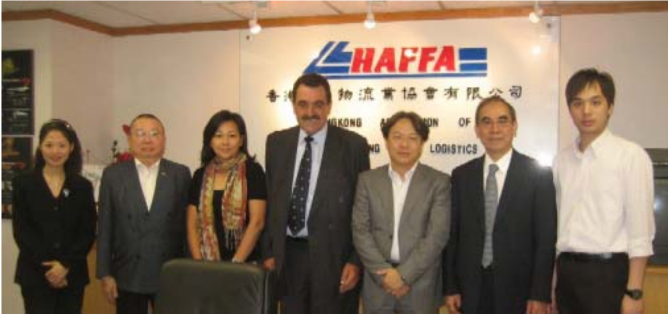
“Focus Group Meeting on 04 September 2008”

For those who had submitted written comments using the questionnaire but were unavailable to join the focus group meeting, the Secretariat had made individual follow-up phone calls to hopefully discuss the issues with these Members in a constructive manner. We acknowledged that all concerned Members understood / agreed to HAFFA’s stance and the way forward to handle the relevant issues.