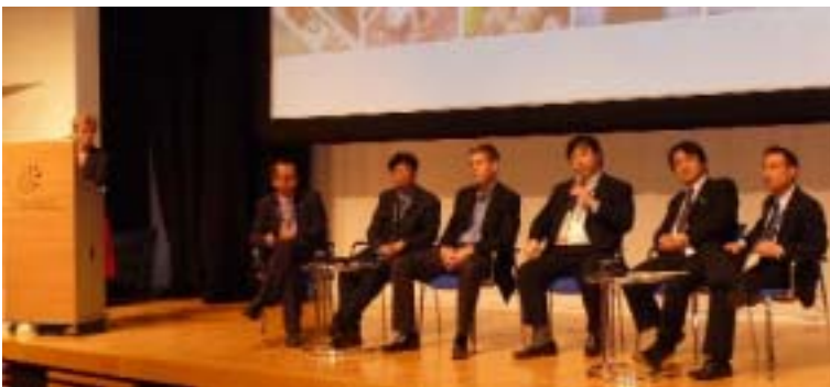
“The program ended by a discussion and wrap up”