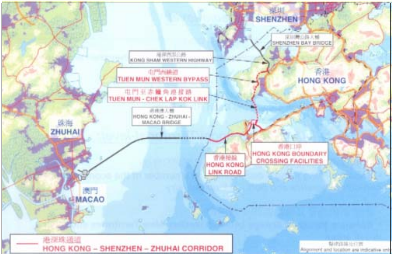
"The Location Plan"

Subsequent to the announcement made by the Chief Executive in the Policy Address in October 2007 for economic growth of Hong Kong, the study of subject proposed infrastructure projects undertaken by the Highways Department has commenced. These projects, composing the Hong Kong – Shenzhen – Zhuhai Corridor, are closely linked with each other and will be implemented in approximately the same timeframe that the current target completion date is in the year of 2016.