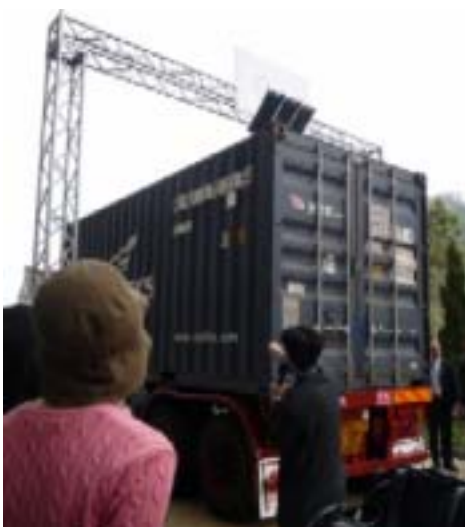
"The container truck attached with passive RFID tags passed through the gate equipped with tag readers of different frequency band"