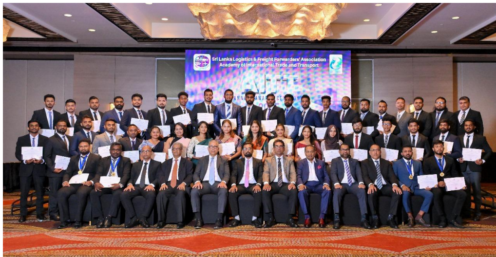
AITT Graduation Ceremony 2025